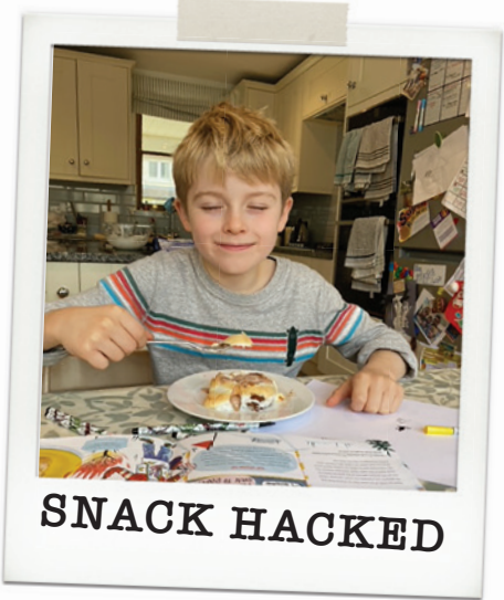
SNACK HACKED I really loved making the Baked Alaska in the Winter Wild issue of AQUILA.